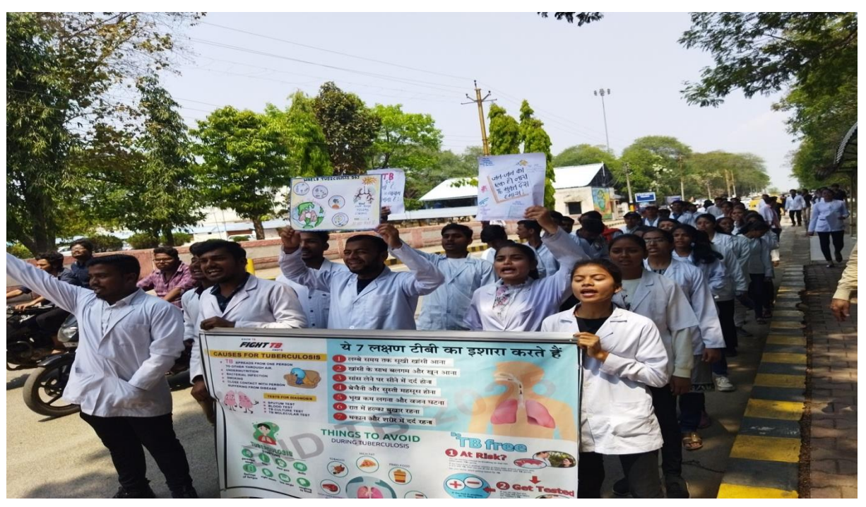
< Rally Passed through Administrative Office, GGV >

<Rally flagging off by Dean School of Natural resources and Head Department of Pharmacy with the Participants and Teachers >